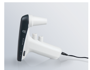
Smart charging technology prevents lazy battery effect