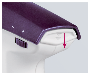
Gravity delivery or blow-out with motor power