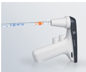
Rest position with inserted pipette

NiMH battery is fully charged in just 4 hours. Working during the charging process is also possible with the charging cable connected.