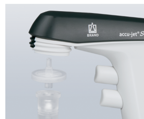
Membrane filter and check valve prevent liquid penetration and over-aspirating liquid