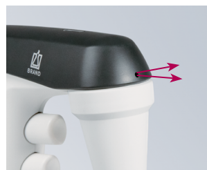
Direct outlet of sample vapors