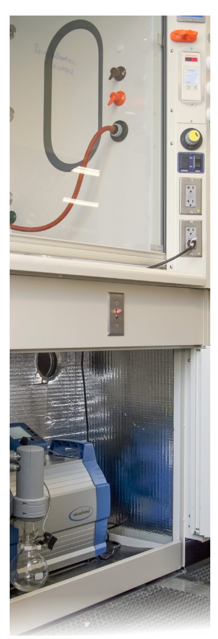
Local vacuum network pump under a fume hood.

So besides the adaptability that was the main reason for the use of local vacuum networks, the energy use over the life of the building is expected to be much lower than if a central system had been installed.