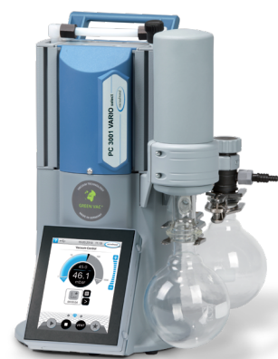
With VACUUBRAND VARIO® technology, pumps can reduce energy use by 90 percent.